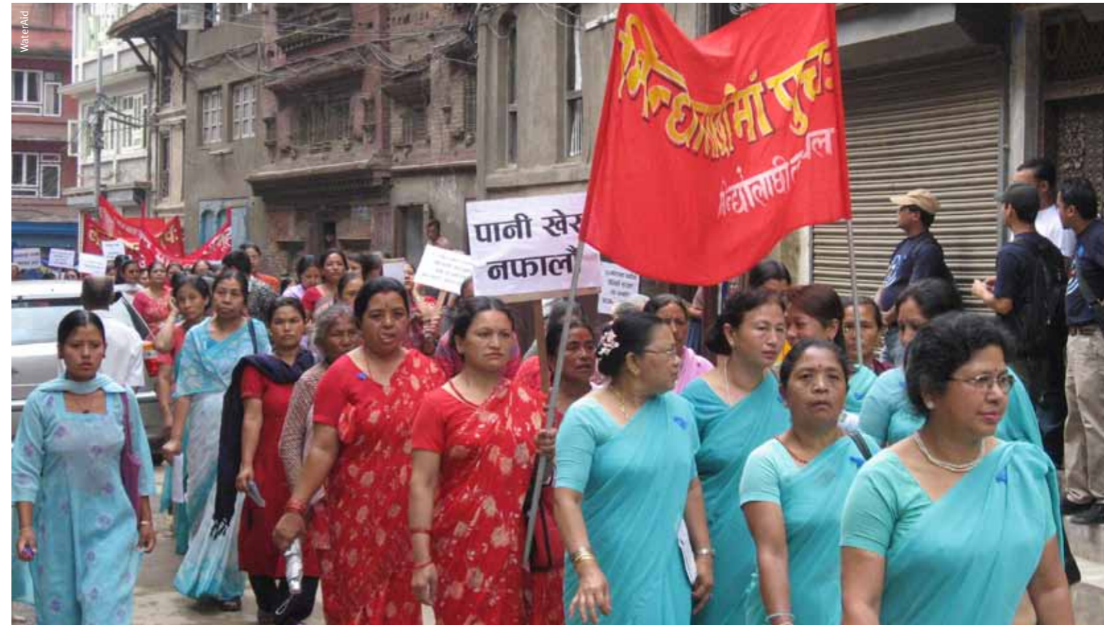
Women in Kathmandu demonstrating on behalf of the 18 million people in Nepal who don't have a toilet.

Access to water and sanitation are basic human rights that everyone in the world should have access to. Yet today one in eight people live without safe water and two in five are without basic sanitation. Every day 4,000 children die as a result. WaterAid and its partner organisations cannot address this crisis alone, so we advocate to influence governments and decision-makers to prioritise these basic services.